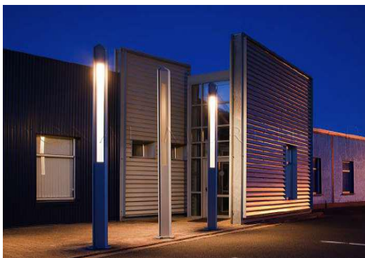
WESTIRE Technology Limited