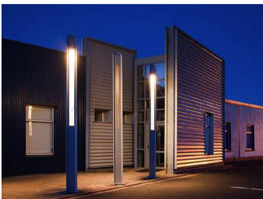
WESTIRE Technology Limited